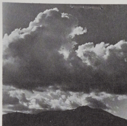
Mr. Tamalpais