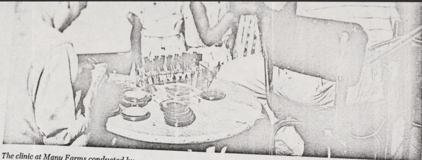
The clinic at Many Farms conducted by Cornell University