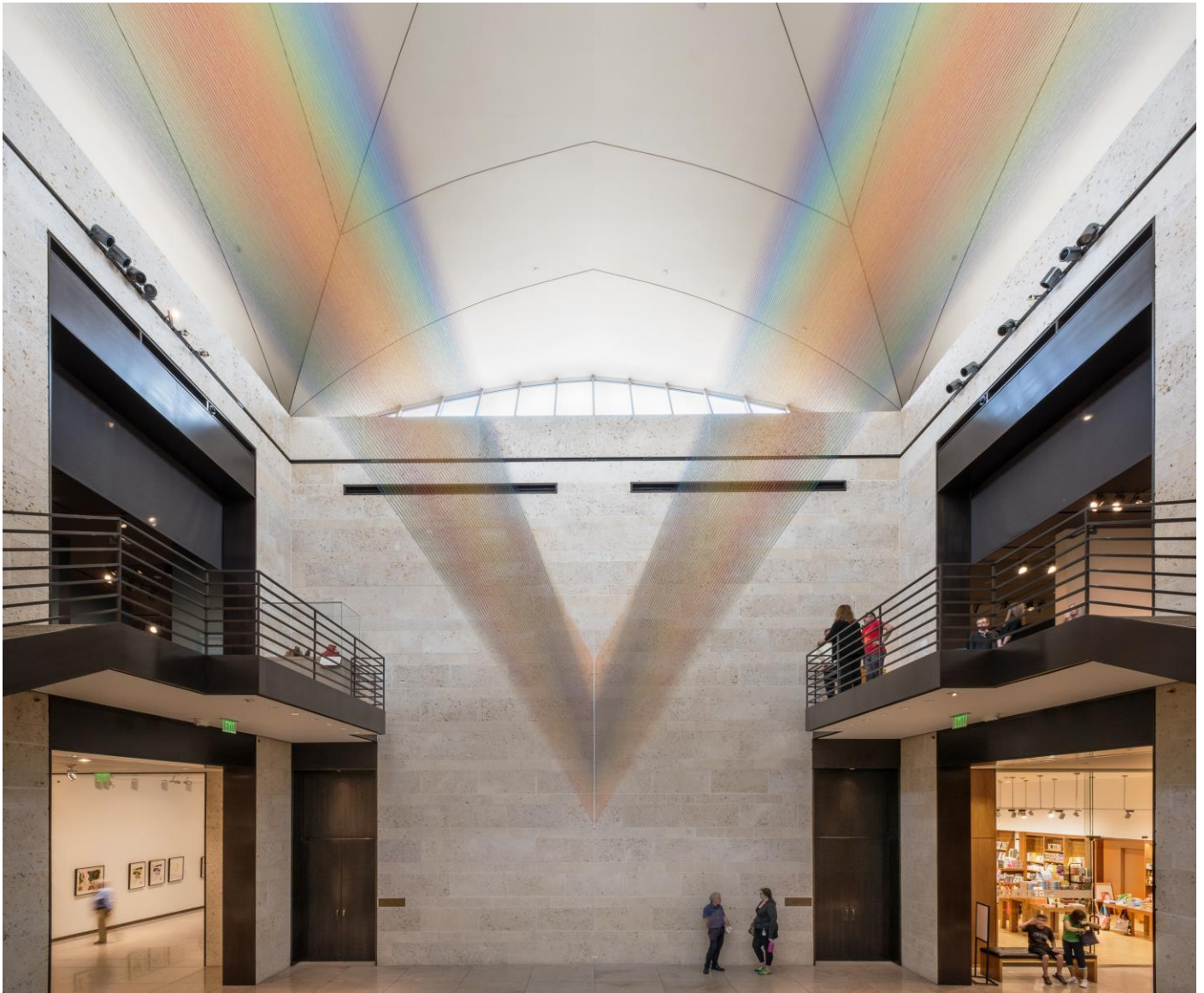
Gabriel Dawe (b. 1973) Plexus no. 34 , 2016 Gütermann thread, painted wood, hooks

Amon Carter Museum of American Art, Fort Worth, Texas, © 2016 Gabriel Dawe 2018.113