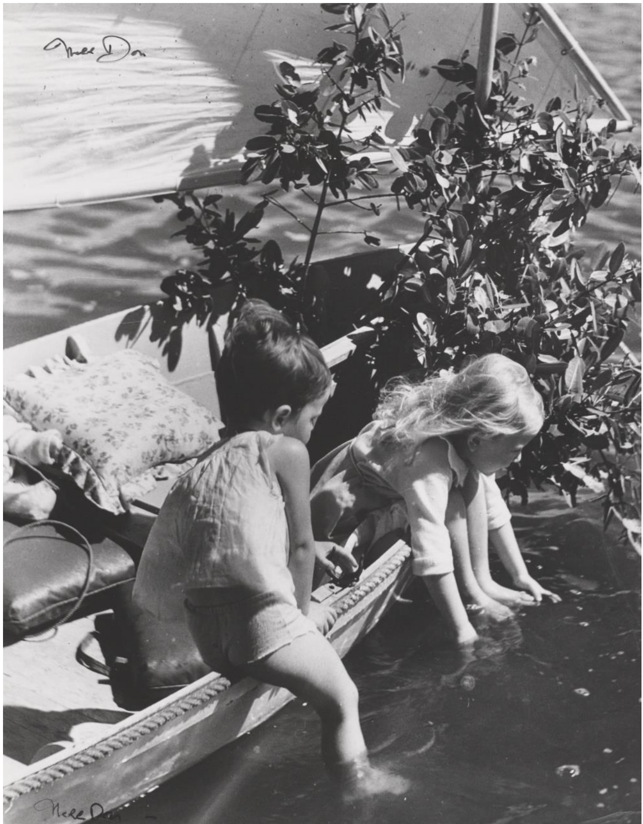
Nell Dorr (1893–1988) Childhood Days , ca. 1924 Gelatin silver print

Amon Carter Museum of American Art, Fort Worth, Texas, Gift of the Estate of Nell Dorr © 1990 Amon Carter Museum of American Art P1990.45.229