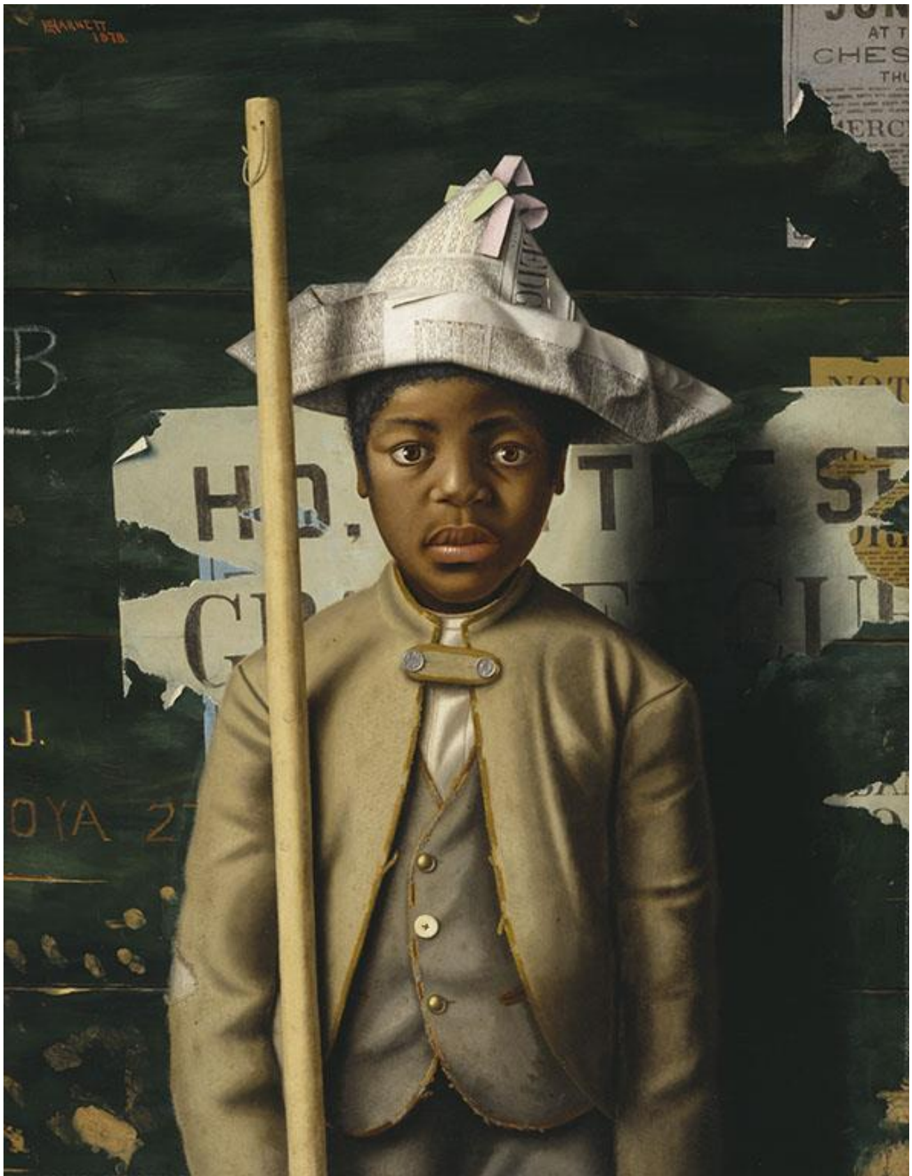
William H. Harnett (1848–1892)